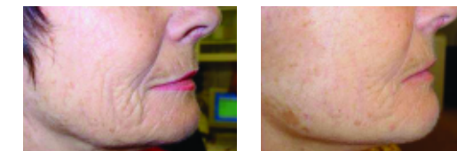
70 YEAR OLD FEMALE, 8-MONTHS AFTER STEM CELL INFUSION TO FACE