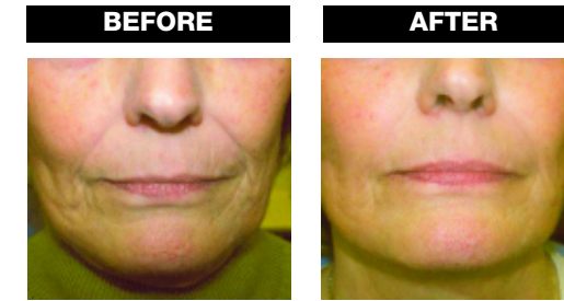
70 YEAR OLD FEMALE, 8-MONTHS AFTER STEM CELL INFUSION TO FACE

THE PROCEDURE: Harvesting of fat cells for cosmetic stem cell improvement. Now available in South Florida.